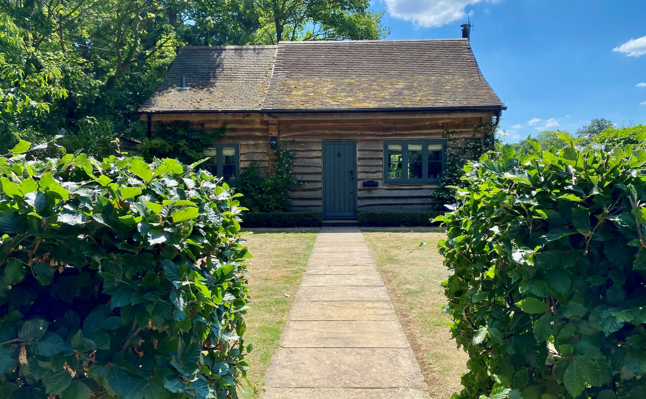
The Wendy House, Haslemere Road, Godalming, Surrey GU8 5PT Freehold